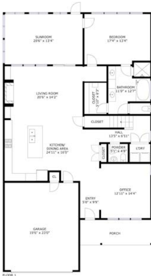
208 BROOKWOOD PARK CT MEASUREMENTS AND SIZES ARE APPROXIMATE